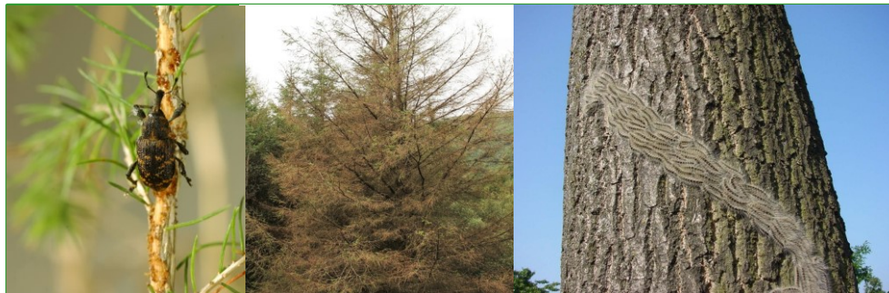
Forest pests: Pine weevil ( Hylobius abietis ), Green spruce aphid damage ( Elatobium abietinum ), oak processionary moth ( Thaumetopoea processionea ),

Please email Katrina.dainton@forestresearch.gov.uk to find out more.