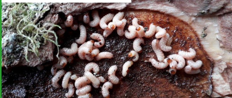
Great spruce bark beetle ( Dendroctonus micans )